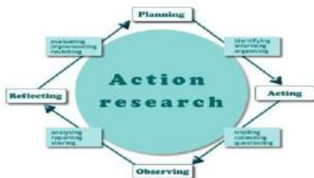
Chart 1. The Action Research Procedures (Cohen et.al., 2000)

In the first step of planning , the researcher identified and searched the information about the learners' need and characteristics. It did to arrange the materials and methods to make the interactive, active, interesting, and motivated teaching-learning English. Indeed, the researcher organized the theme, task, and procedures in implementing the five 'R' methods.